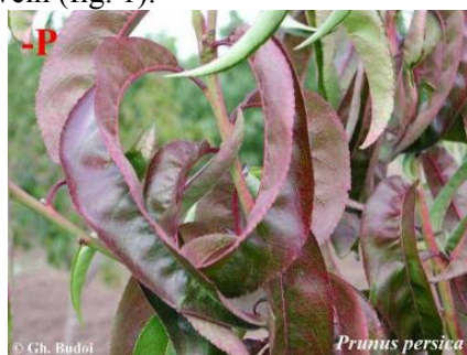
Fig. 2. P deficiency in peach – Prunus persica

The violaceous and reddish-violaceous tints determined by P deficiency must not be confused with the violaceous tints produced by K deficiency (fig. 3),