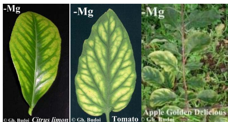
Fig. 5. Visual symptoms of Mg deficiency on basal leaves of: lemon tree – Citrus limon , tomato – leaflet, apple tree – "Golden delicious" variety

Mg deficiency. Like in N, P and K, the visual symptoms appear first on the leaves from the base of the plant or yearly shoots and progress towards those from tip. From all nutrients, to Mg the visual symptoms of the leaves vary the most according to plant species. To most Dicotyledonatae , on leaves appear marginal chlorosis, followed or not by tissues' necrosis (most frequently, yes), which progress between the main veins towards the median vein; generally, the median vein, the main veins and a bend along them remain green long time from the chlorosis' appearance (fig. 5), this band being narrower towards the end of the vein and more and more larger towards the base of the vein. In tomatoes, a green area at the lamina's edge can persist for a long time (fig. 5). In some species (cotton, cucumber, potato, sweet cherry tree), the chlorosis and necrosis begin from the middle of the lamina and progress towards the borders. For other details,