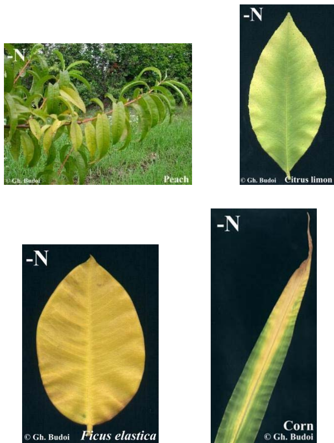
Fig. 1. Visual symptoms of N deficiency: appear first on basal leaves and extend towards those from tip (see peach); chlorosis beginning from the top and borders of lamina ( Citrus sinensis ) (the most general case); relative uniform chlorosis on all lamina ( Ficus elastica ); chlorosis in V shape with the tip on median vein (particular case, e.g. corn) (original images, copyright Gh. Budoï)

poorer in that nutrient. The disorders can manifest by visual symptoms on different plant's organs, the most taken into consideration being the leaf. In the case of nutrients with high mobility within the plant – such as the first four essential macronutrients: N, P, K and Mg , which make the object of agrochemical interventions – nutrients that can be retranslocated to the growing points, the visual symptoms of the deficiencies appear first on the oldest leaves from the base of plant or yearly shoots, or from the exterior of leaf rosette (e.g. sugar beet, cabbage) and extend from the base to the top, or from the exterior to the interior of the rosette, respectively, in the case of deficiency's persistence. To the nutrients