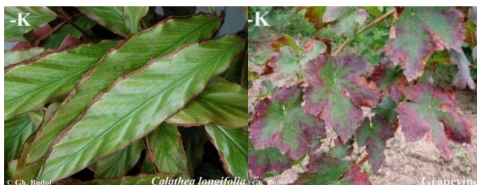
Fig. 3. K deficiency in Calathea longifolia (marginal necrosis, general case), and in grapevine, "Black Kışmış" variety (particular case: violaceous tints followed by brown necrosis) (original images, copyright Gh. Budoi)

K deficiency. Like in N and P, the visual symptoms appear first on the leaves from the base of plant or yearly shoots and progress towards those from tip. Generally, the marginal chlorosis of the lamina are rapidly followed by brown (fig. 3, Calathea ), greish-brown, reddish-brown up to dark brown necrosis (scorches) which progress towards the median vein. Finally, the leaves drye and die.